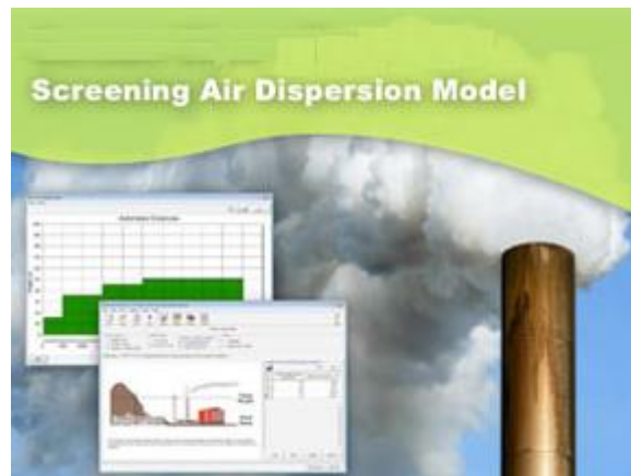
US EPA SCREEN3 Model